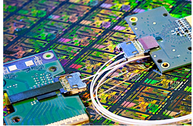
Figure 4 Intel Si Photonic Transceivers

systems; test prototype circuitry through an OEM partner - and create dialog on low cost manufacturing techniques. Our OEM partners in the mid-board optical interconnect TWG will work with us on chip, package and IO port interconnect.